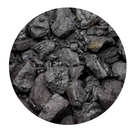
Coal is rock that burns easily and is mined from the earth.

Parent/Family Note: Have younger children create reminder signs to help them remember to conserve energy. For example, they can make a sign to put by the light switch in their bedroom that reminds them to turn off the light when they leave the room.