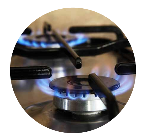
Natural gas is found in reservoirs trapped within the earth.