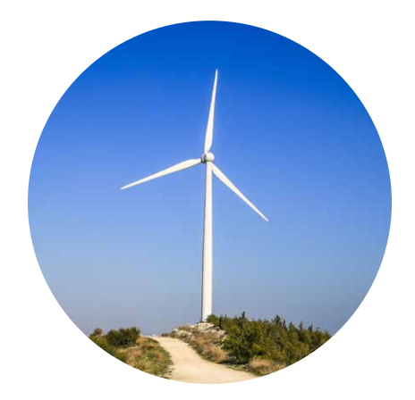
Wind can also transform energy by moving turbines.