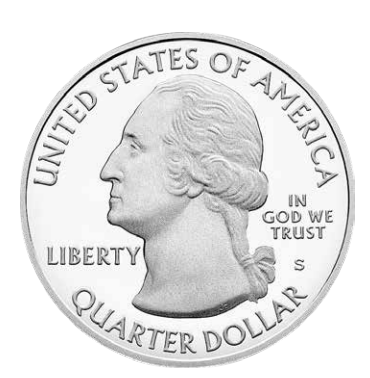
Quarter = 25 cents