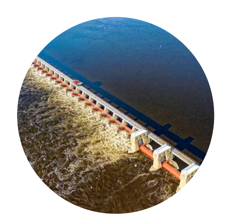
Hydro transforms energy from running water.