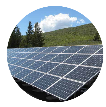
Solar stores energy from sunlight.