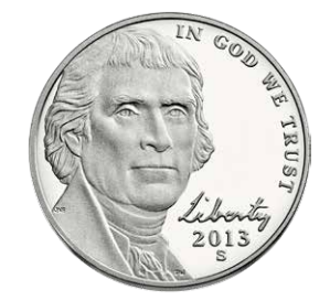
Nickel = 5 cents